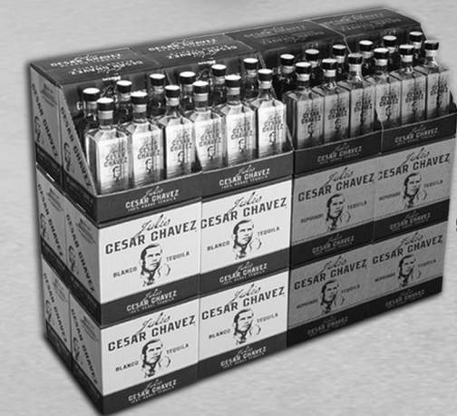
24 Case Display 43.16"W x 7.21"L x 30.96"H