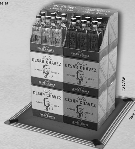
12 Case Display 21.58"W x 7.21"L x 30.96"H w/ Floor Mat