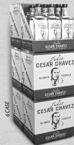
6 Case Display 10.79"W x 7.21"L x 30.96"H

* For more information regarding our marketing support material please visit our website at www.jcchaveztequila.com/trade